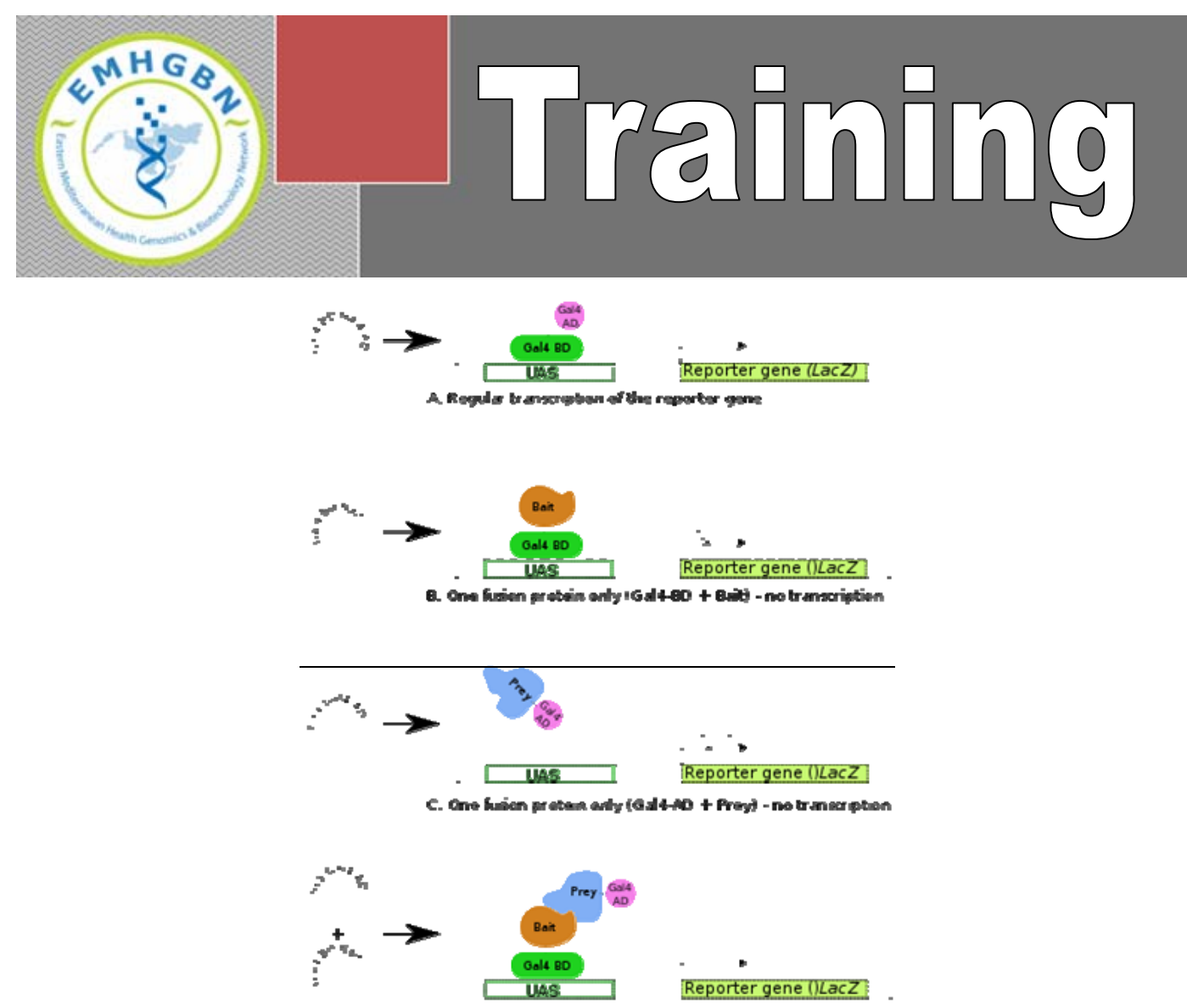
D. Two fusion protons with interacting Gait and Prey